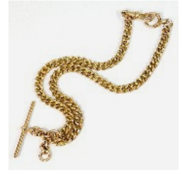
Sold for £780... a gold watch chain sold on behalf of a local Cornwall charity for above its 'scrap' value...