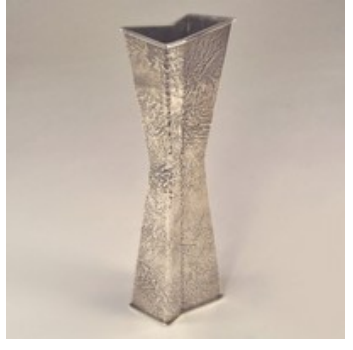
Sold for £840... a Scandinavian designer silver vase, identified & sold for a local emergency charity after worldwide bids...