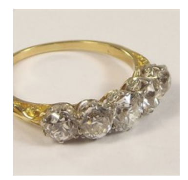
Sold for £950... a gold & diamond ring sold on behalf of a mental health charity after careful appraisal of quality & value ...